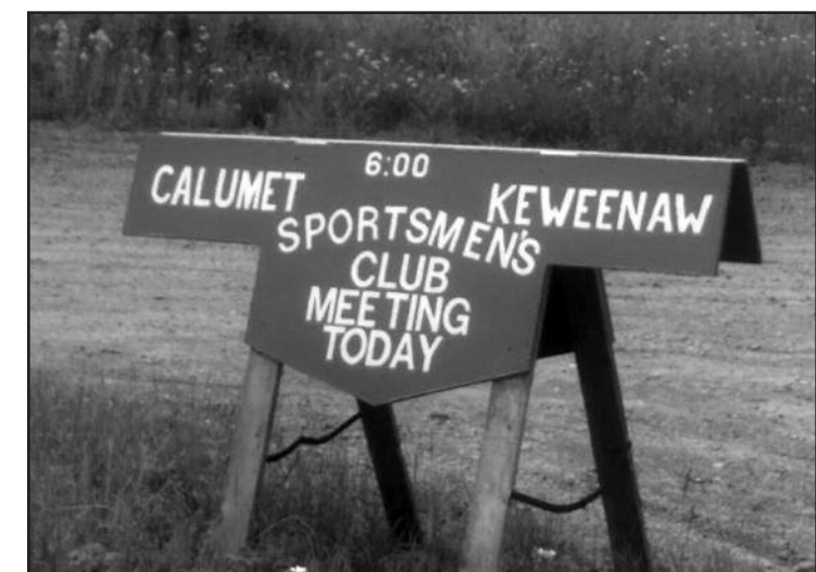
Meeting sign posted.