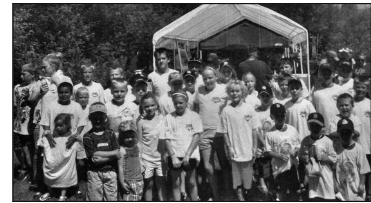
Some of the youth at the fishing derby sporting their Calumet-Keweenaw Sportsmen's Club t-shirts.