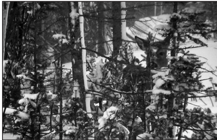
Deer hiding behind the brush.

The UP DNR wildlife supervisor noted in a recent town hall meeting with other DNR officers, our State Representative, a staff member of our State Senator's office and Natural Resource Commission UP members that severe winters have severely impacted UP deer populations. He said "the best we can tell, the last three years our numbers have gone down 50 to 60 per cent...we had vast areas where we weren't seeing anything." Lack of deer was certainly evident in the Keweenaw. Hunters