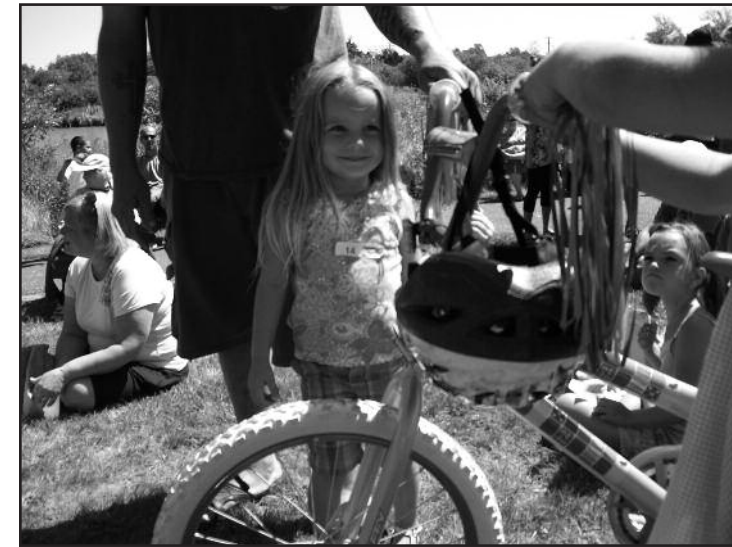
One happy little girl and her new bike.